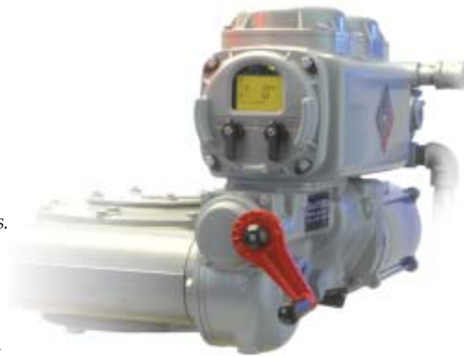
▲ TEC2000 mounted on gear box for heavy-duty quarter-turn use. No auxiliary gear drive is required for quarter-turn valve torques up to 2,200 ft-lbs.