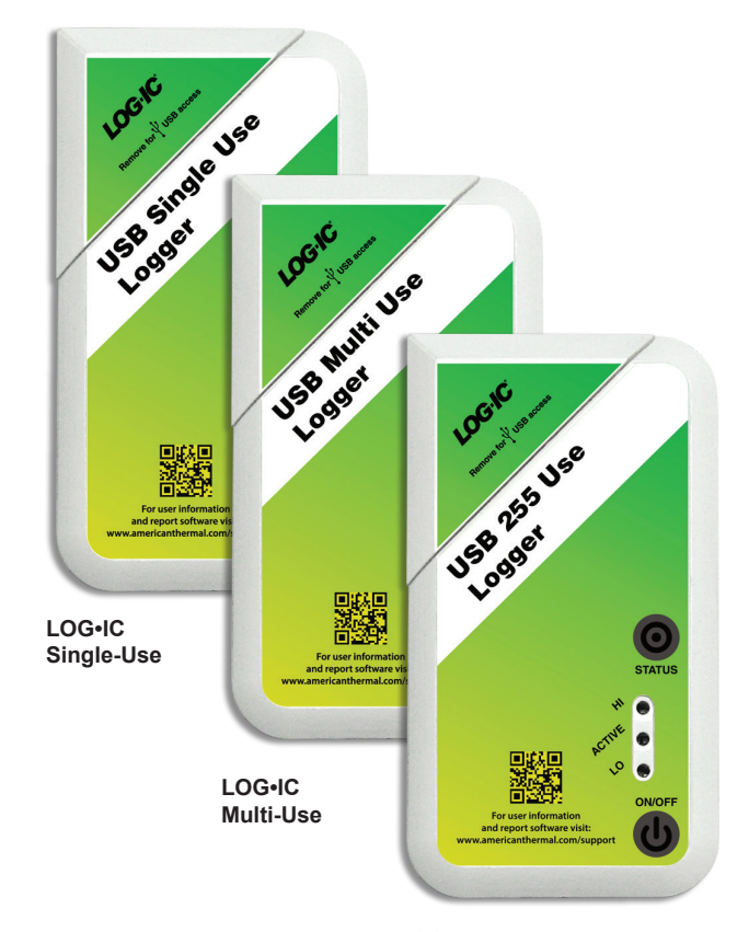
LOG•IC 255 Use